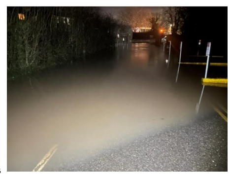
Foxbank Ind Estate entrance

not unusual for this volume of rainfall on an annual basis the amount of rainfall over a prolonged period starting in October was high and followed the pattern of previous