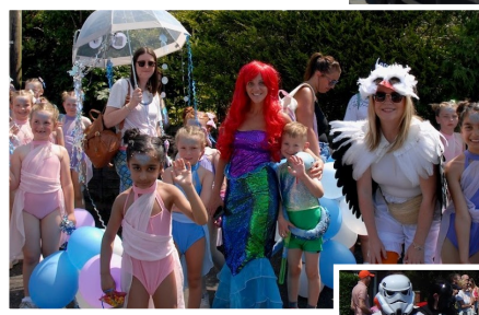
Walking groups: 1st place R S Dance Academy with "The Little Mermaid"

The lucky children who made up the Carnival Royal Family were selected by raffle draw back in March, at our Family Disco and Royal Family Draw, which took place at Manorfield School. The float and the children all looked lovely! This float – and indeed the other eight lorry floats, were all supplied by Calor – and we're very grateful to both the company and their fabulous drivers.