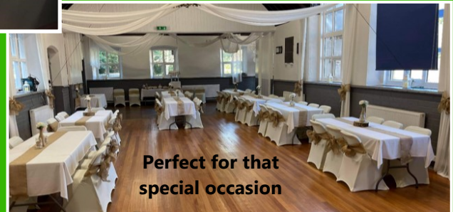
Perfect for that special occasion

Following the financial year end, Council discussed the village hall income, running costs and repair costs and feel a small increase from current £12.50 is needed for hall hire to help maintain our lovely building. The new charges will not start until September and they will be:- £14 per hour for village residents and regular users and £18 per hour for NON-residents and one-off users.