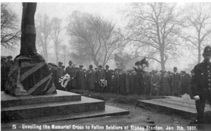
55 - Unveiling the Memorial Cross to Fallen Soldiers at Stoney Stanton, Jan 7th, 1921.